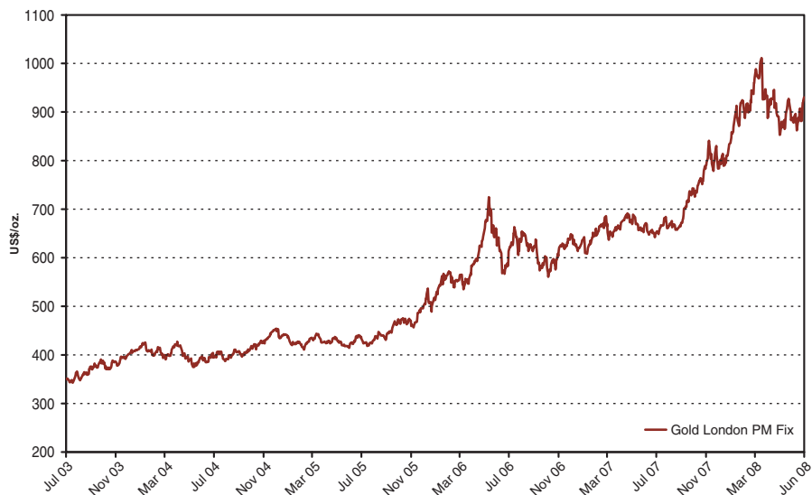
Daily gold price - July 1, 2003 to June 30, 2008

After reaching a 20-year low of $252.80 per ounce at the London PM Fix on July 20, 1999, the gold price gradually increased. The average gold price for 2003 was $363.32 per ounce, the average for 2004 was $409.17 per ounce and the average for 2005 was $444.45 per ounce. During the year 2006, the gold price ranged between a low of $524.75 on January 5, and a high of $725.00 on May 12, with the average for the year being $603.77. In the first eight months of 2007 the gold price traded in a range between a low of